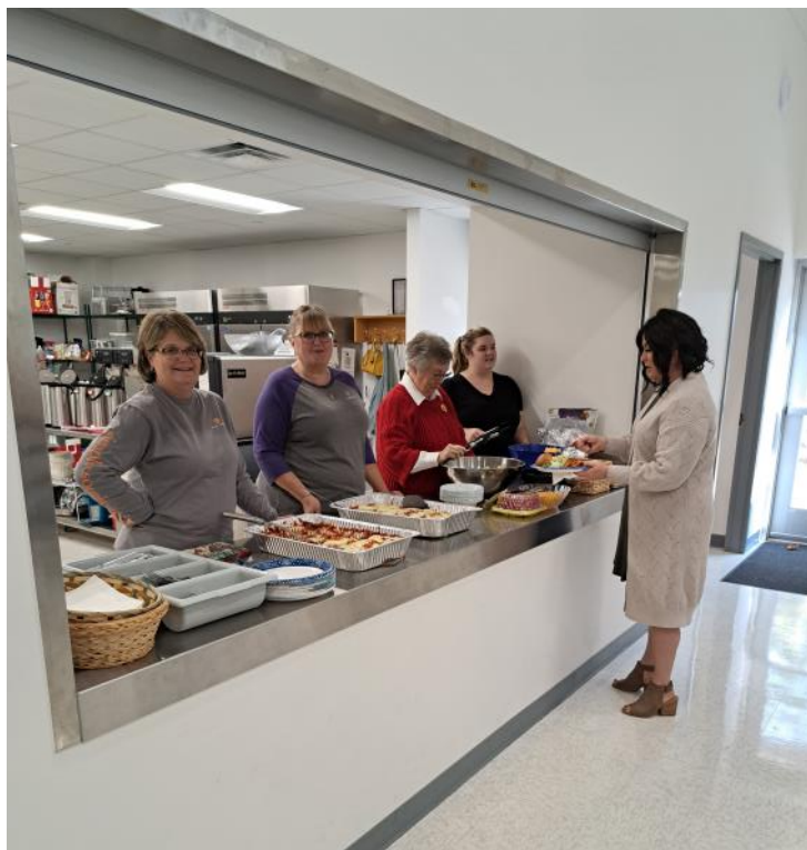
Dorcas Guild serving student lunch