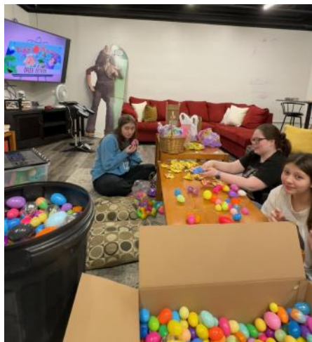
High School Ladies Bible Study helps fill the Easter eggs.